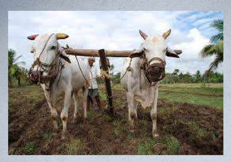
..My yoke is easy, kind 5543 χρηστος chrestos khrase-tos'